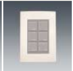
DALI Kiss page 15 | 8