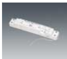
radio control unit 1-10V L x B x H: 187 x 28mm