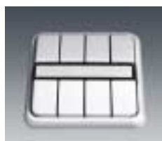
radio wall transmitter flat, white | individual operation of 4 channels or 2 channels and 4 scenes L x B x H: 81 x 81 x 17mm