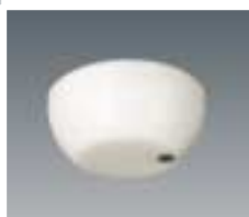
radio light sensor D x H: 52 x 23mm