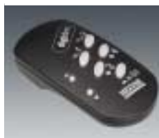
remote control for control of 4 groups, 4 scenes, on/off, lighter/darker, and for the starting of simple operations order number: 5LZ 905 303 B x L x H: 56 x 120 x 25mm