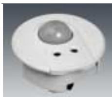
Multisensor light sensor, movement detector and infrared receiver order number: 5LZ 905 312 Dia. x D x installed depth: 65 x 10 x 28mm