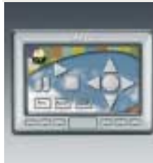
DALI Comfort page 15 | 4