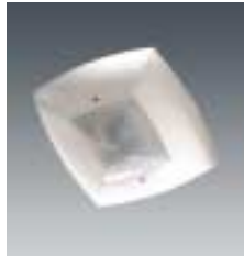
Presence Detector page 15 | 10