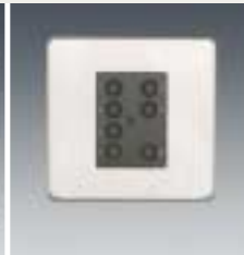
DALI Digidim page 15 | 6