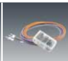
DALI KISS SC scene module with 4 independent inputs | operation of 4 DALI scene with conventional reflex switches