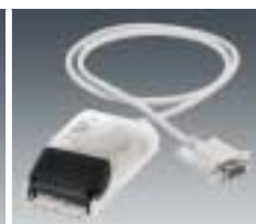
DALI KISS SCI serial computer interface (RS232) | controlled with winDIM/DALI KISS