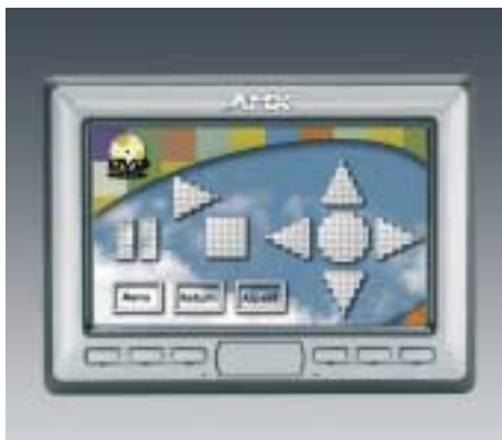
7" touch panel for table-surface and recessed wall mounting with integrated microphone | loudspeaker | movement and light sensor | 6 freely allocatable control keys