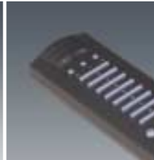
Remote Control page 15 | 11