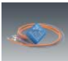
DALI KISS GC group module with 2 independent inputs | operation of 2 DALI groups with conventional reflex switches