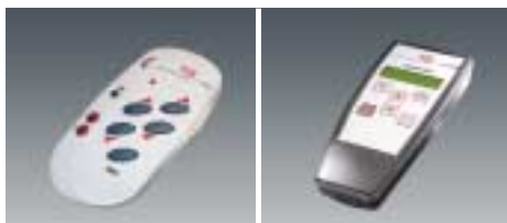
user remote control