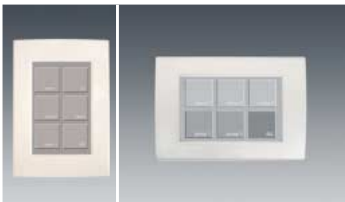
DALI Mini Touch Panel white, vertically mounted | group and scene operation, inc. 6 layout cards

benefits ■ DALI Mini touch panel for controlling groups and scenes | inc. 6 layout cards, for wall surface mounting, vertical or horizontal | white or silver | implementation of DALI lines possible ■ allocation of DALI nodes to groups directly from the group modules with simple push-button sequences ■ programming of light scenes from all scene modules (without PC or laptop) ■ integration of KISS systems for programming and operation into existing office infra-structures with PC