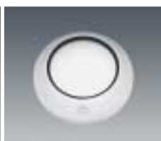
radio presence detector with integrated light sensor for constant light controlling D x H: 103 x 42mm