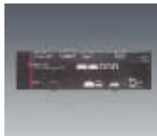
DALI Comfort control unit